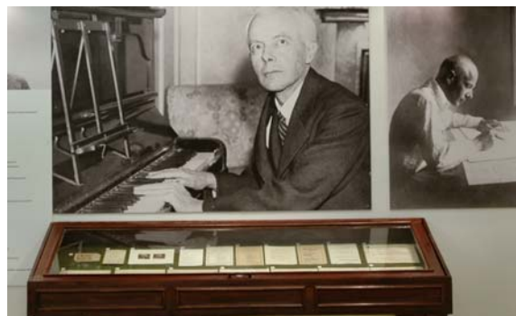
Showcase 4

Between 22 and 24 March 2006, an international musicological conference with the title “Bartók’s Orbit” was held at the Institute for Musicology. The opening ceremony of the exhibition was held on that occasion.