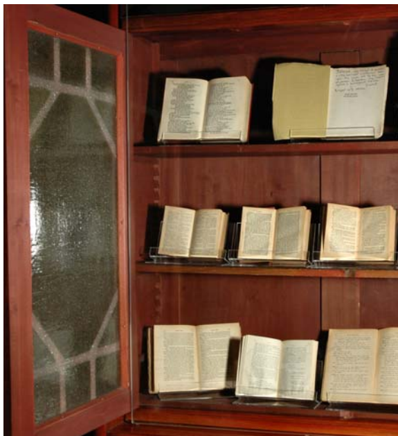
From Bartók's library

of the juvenile compositions established a new standard in source-oriented Bartók documentary studies. A close contact with performance practice, advising recording projects, and the edition of Bartók's complete recordings also belong to the profile of the archive. The Bartók Archives, although not linked with a university, due to the unique material and the expertise of its fellows, continuously support graduate and postgraduate studies (including Ph.D. dissertations). Recently the study of Bartók's compositional process and the foundation of complex projects are in the forefront of the archive's activity: the preparations of sample volumes for the Béla Bartók Complete Critical Edition , and the production of the Bartók Thematic Catalogue .